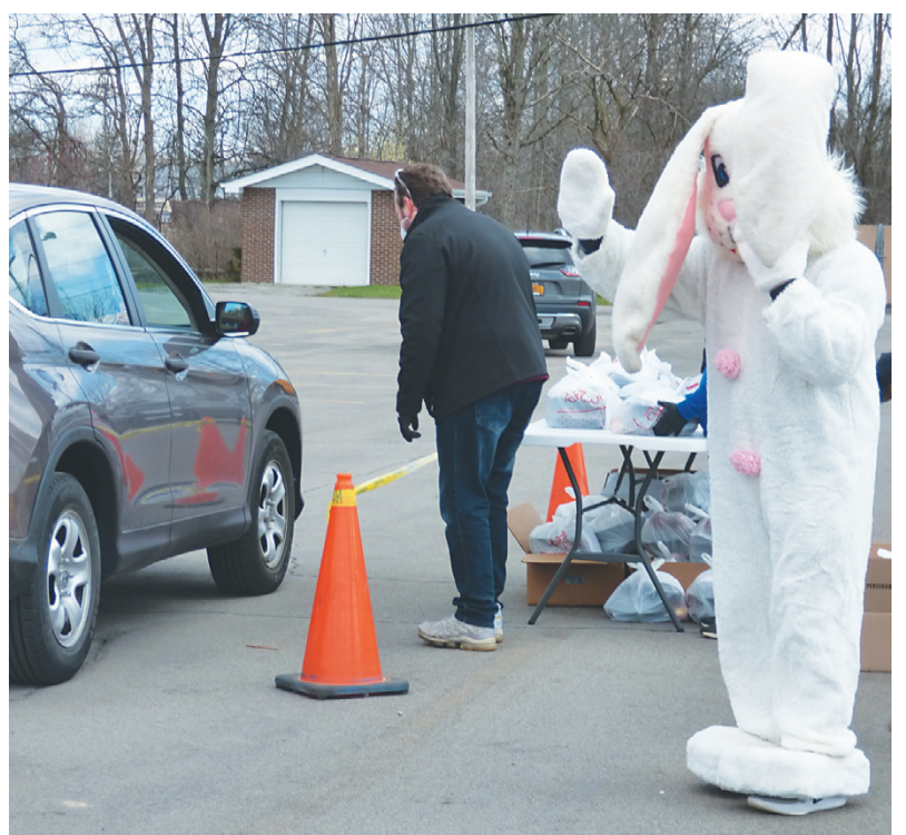
Top: Lewiston No. 1 Fire Co. and the Lewiston Police Department were out with the Easter Bunny last Saturday, driving him around area streets.